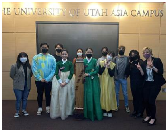
Spring '21 Int'l Student Diplomats

Before arrival, we'll ask you via email for your KAKAO ID and add you to a shared student chat so you can meet other UAC students and also meet our Diplomats. They're a great resource for questions and support.