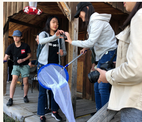
2019 participants learn about native bees during field study at the U's Taft-Nicholson Center for Environmental Humanities.