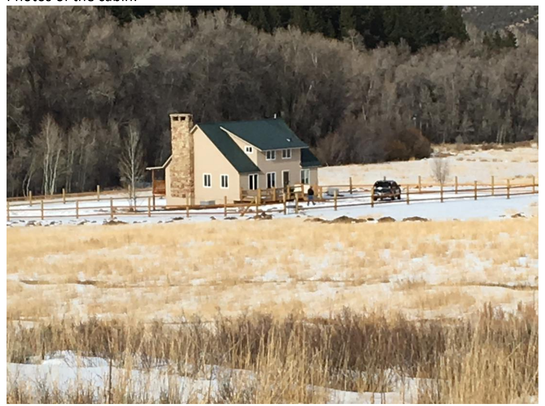
Cabin from Rt. 35