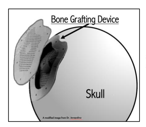
Figure 1: Illustration giving an example of the bone grafting device implanted in a skull. Note that it is porous to allow vasculature access, it has an overhang for screws to attach the device to the skull, and a reservoir for storing osteogenic materials.

With the complications that arise when using rigid metal fixations for treating craniofacial defects, the emergence of bioresorbable fixations have been used commonly to decrease the complications. In addition, rigid metal fixations must be removed from pediatric patients through a second invasive surgery because they have developing skulls that increase the risk of fixation migration. In my work, a bioresorbable fixation device that allows for storage of bone grafts was designed (Fig. 1). The cell adhesion properties of poly-lactic-co-collide (PLG) and hydroxyapatite (HA), two materials commonly used in craniofacial reconstruction, were also experimented. The results of the cell culture experiments helped us determine that PLG was the optimal material to 3D print our bone grafting device we designed using SolidWorks. The dimensions of the 3D printed models were tested via in vitro surgery on a pig skull (Fig. 2). This work ultimately demonstrated the final design for the bone grafting device that we plan to use in a future animal study. The findings in this study brings the research lab a significant step closer towards using the bone grafting device for upcoming animal studies and creating a better treatment option for treating craniofacial defects in pediatric patients.