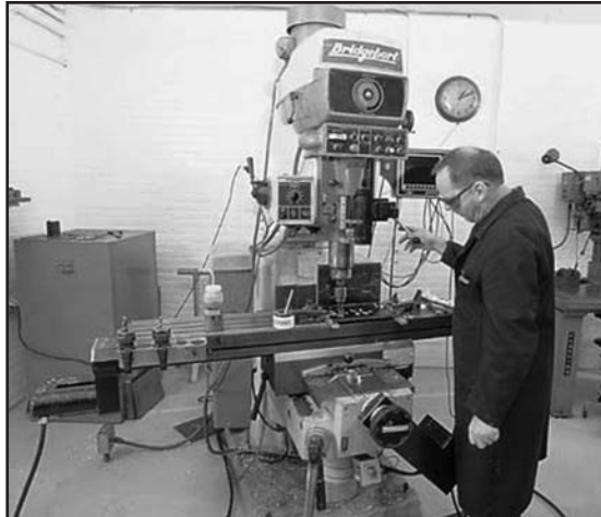
Georgia Tech Research Institute

The vertical mill, or "column and knee" mill, is the most common milling machine found in machine shops today. The general construction of this mill includes the quill, which moves vertically in the head and contains the spindle and cutting tools. The knee moves up and down by sliding parallel to the column. The column holds the turret, which allows the milling head to be positioned anywhere above the table. Hand wheels move the work table to the left and right (X axis), in and out (Y axis), in addition to moving the knee, saddle, and worktable up and down (Z axis).